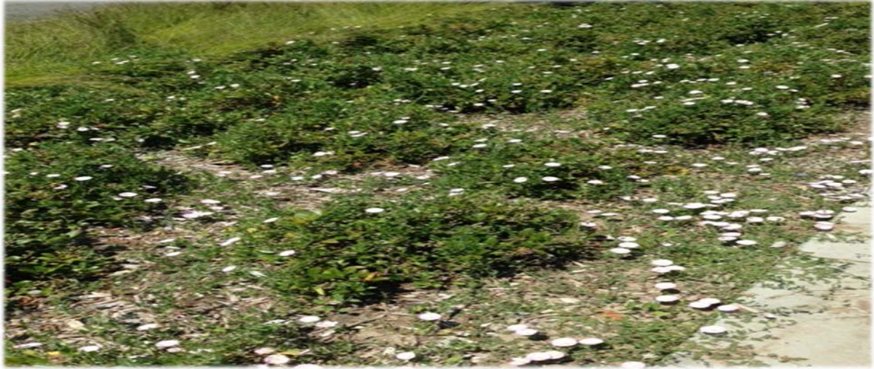
Field Bindweed has woven itself into the ground cover, making it impossible to control with non-selective organic products.

Selective and systemic weed killer products only affect the weed and not the desirable plant material surrounding the weed. The weed killer enters the plant through the leaf and moves throughout the weed for a complete eradication. Organic products available for use at this time are neither selective nor systemic. The organic products burn down all foliage they come in contact with, including desirable plants.