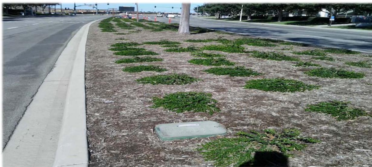
Example of successful habitat modification.

As an alternative to higher level pesticide application, the City's landscape maintenance contractor converted the landscape palette to a ground cover type that deters the vole activity. This project eliminated the need for any pesticide and improved the overall appearance of the street median.