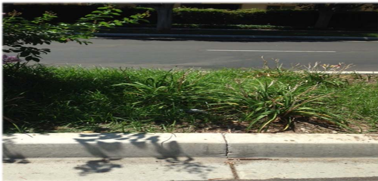
Nutsedge in a street median that has overtaken the desirable plant material.

For right-of-way weed control, the City's landscape maintenance contractors were effective at controlling a majority of the weeds using organic products. For approximately 100 acres of non-landscaped areas (concrete medians and sidewalks), weekly treatments during the spring months and bi-weekly treatments the rest of the year provided satisfactory control. For approximately 900 acres of landscaped medians and parkways, manual hand weeding still remains a priority to limit pesticide usage. However, the vast acreage, rapid regrowth of perennial weeds, and the abundance of weed seed that gets dispersed daily by winds and traffic limits the City's ability to completely control weeds in these areas. The presence of perennial weeds, nutsedge, field bindweed and Bermuda grass equates to roughly five percent of the weed population not successfully controlled by the current maintenance practice.