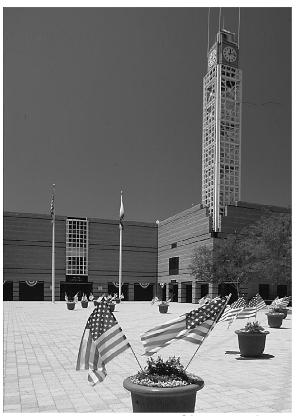
City Hall Piazza

The City of Irvine is located approximately two miles inland from the Pacific Ocean and 40 miles south of the City of Los Angeles. The City of San Diego is 80 miles south of Irvine.