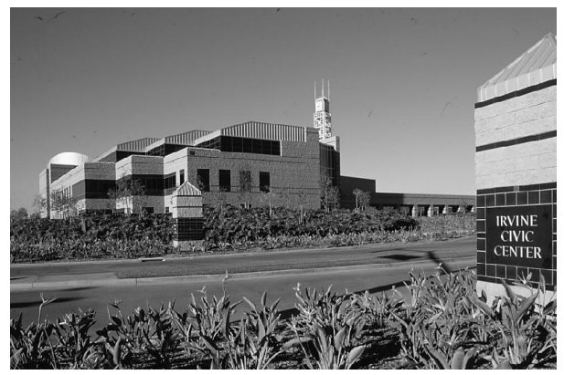
Irvine City Hall

Components of the urban design theme consist of a mix of land uses with a unique image and character including natural (hills and flatlands) and manmade (architectural styles, landscape and open space spines) features. Implementation of the General Plan's policies and standards creates a cohesive yet diversified image and identity for the community.