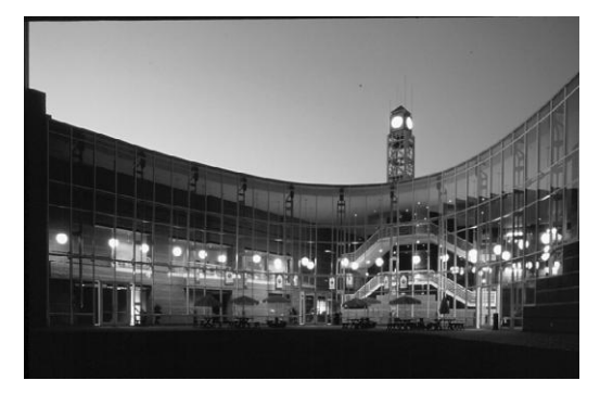
Irvine City Hall