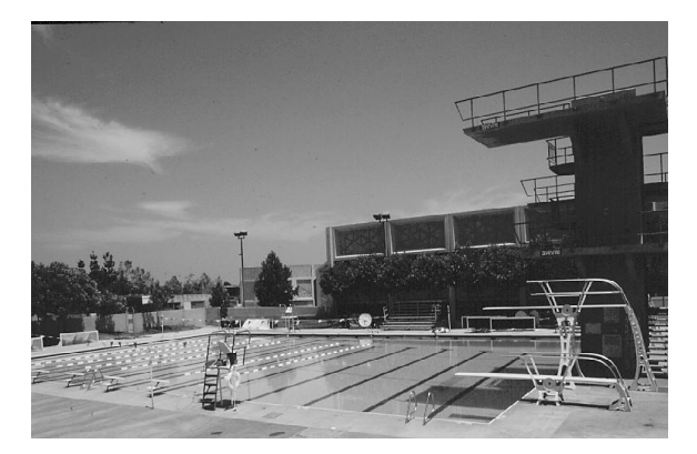
Heritage Park - Aquatics

City facilities and services include neighborhood parks, community parks and programs, the Civic Center, the Aquatics Center, and police services. The City jointly provides other facilities with other public agencies including a community theater, child care centers, athletic complexes, an adult day care center, transportation services and fire stations. These facilities are provided through joint development, joint use or through joint powers authorities.