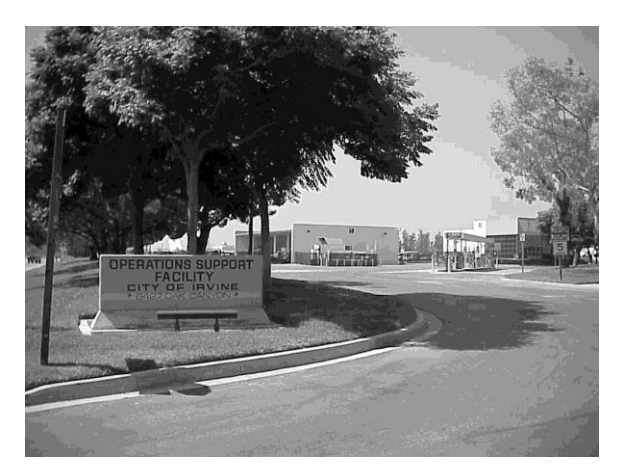
Irvine Corporate Yard

Policy (t) Locate public programs, services and facilities on sites which have convenient user access to on-street transit services and off-street trails.