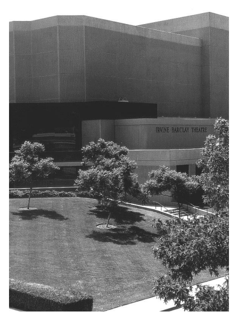
Irvine Barclay Theatre

Community facilities and services provided by others include libraries, churches, schools, a hospital, child care centers, an amphitheater, museums, private neighborhood parks, colleges and universities, and a range of social service programs. One community facility that has yet to be developed in the City is a cemetery.