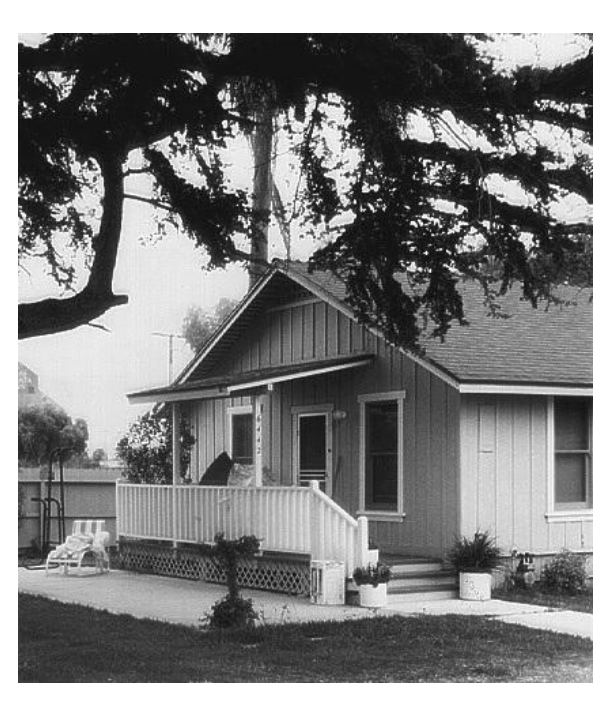
Farm House - Old Town Irvine