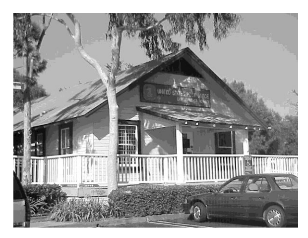
Old Town Irvine

Policy (b): Encourage the nomination of significant historical sites to the National Registry of Historic Places.