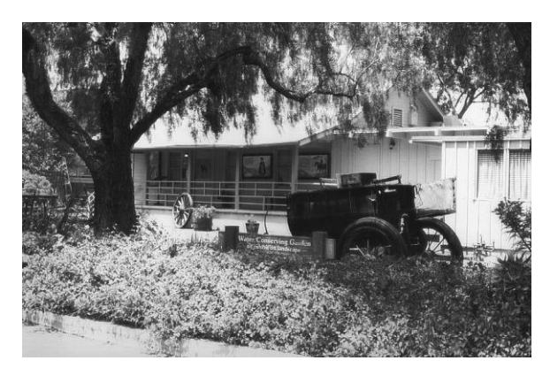
Historical Society Museum

The historic and archaeological sites recorded by previous surveys are illustrated in Figure E-1. There are two sites found in the City of Irvine, Barton's Mound and the Portola Campsite at Tomato Springs, found in the California Inventory. While only two of the historic sites within the City are listed in the California Inventory of Historic Resources, many others qualify. Several of the more important sites may also qualify for listing in the National Register of Historic Places.