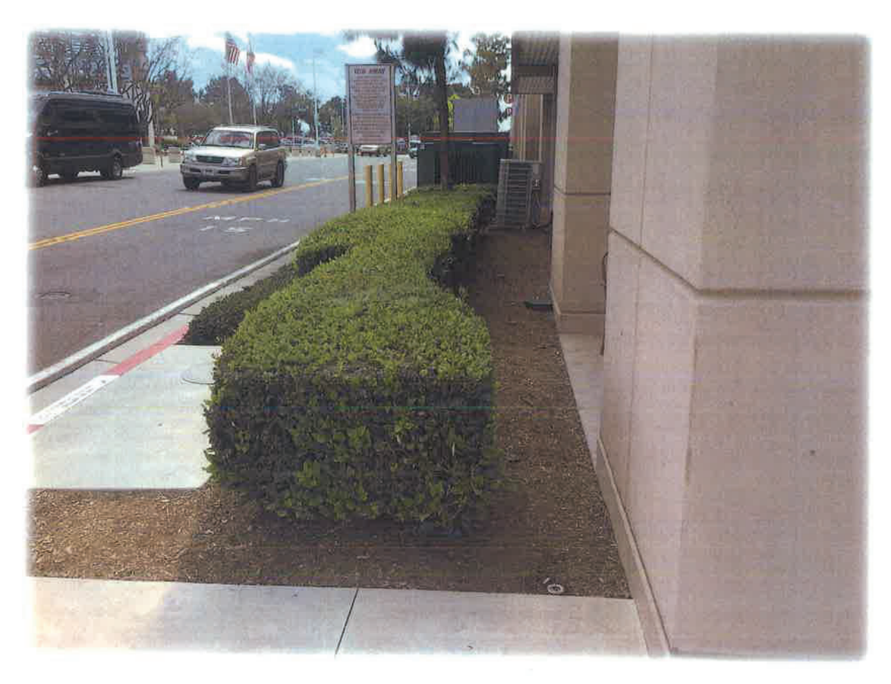
Example of shrubs removed away from buildings to remove potential nesting sites.