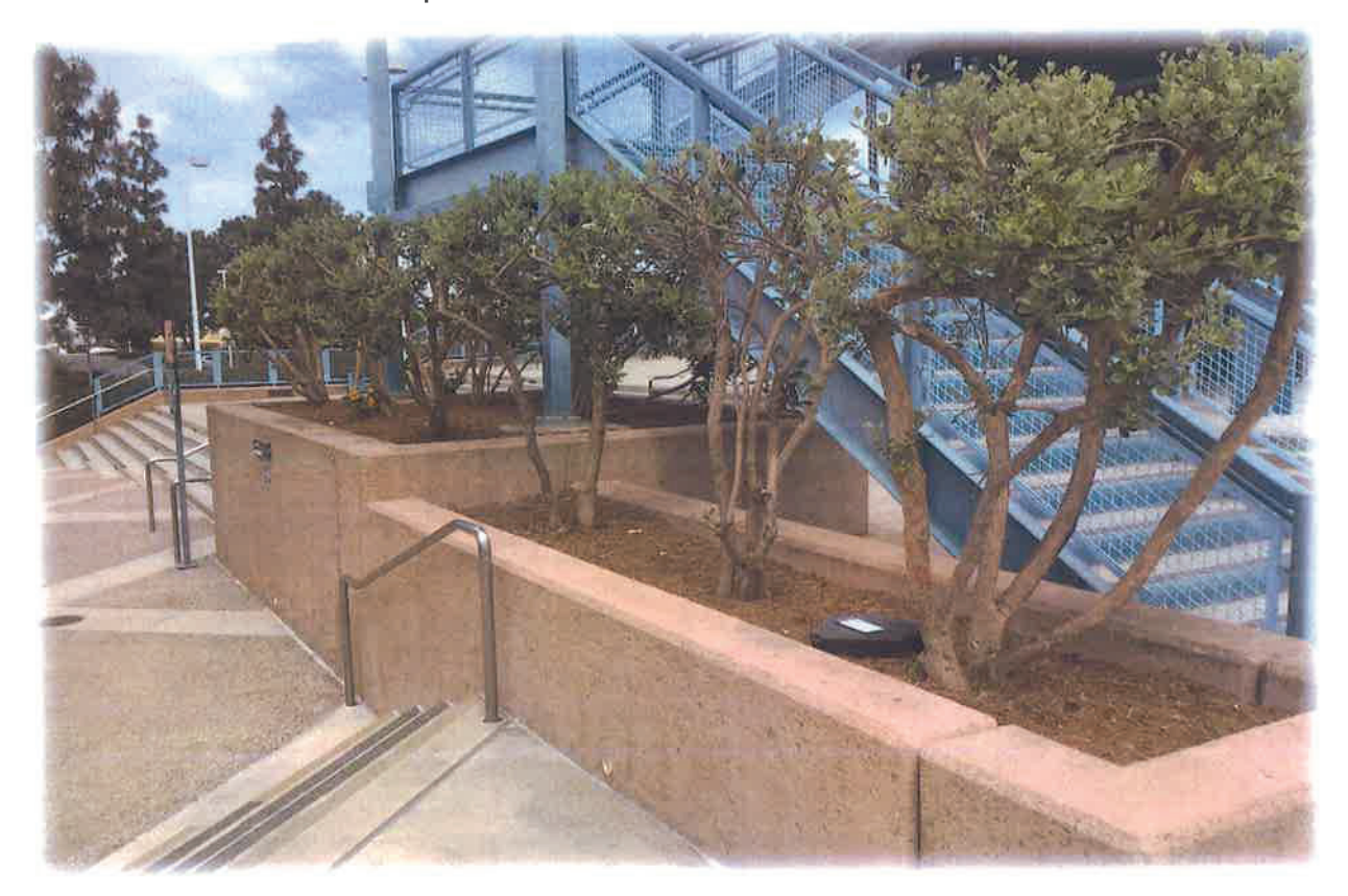
Example of raising shrub canopies to reduce covered habitat for rodents.

Another method employed by staff to control pests in 2018 was habitat modification. This method was used at the Irvine Transportation Center to combat an infestation of rats and mice. Landscape modification was implemented by trimming away tree branches from hanging over or touching buildings. For example, shrubs were pruned away from the foundation of buildings. This modification discourages nesting of rodents and removes covered, protected movement. Open trashcan receptacles were replaced with Solar Big Bellies enclosed trash receptacles to eliminate a food source.