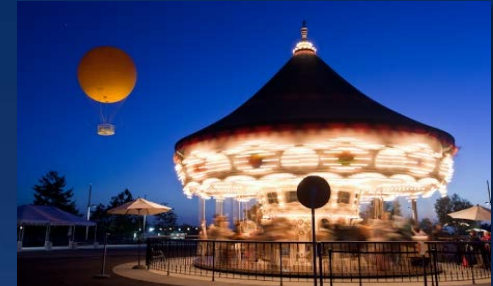
Balloon & Carousel