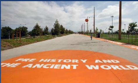
Walkable Historic Timeline