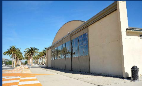
Historic Hangar 244