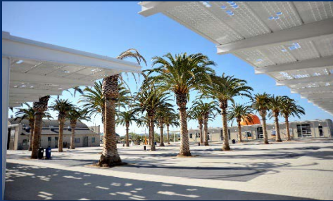
Palm Court Arts Complex