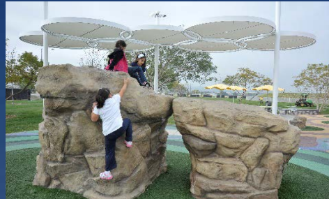
Kids Rock Playground