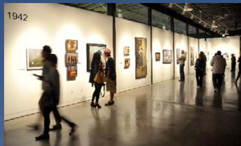
Great Park Gallery & Artists Studio