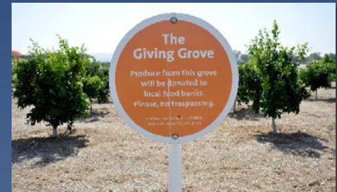
The Giving Grove