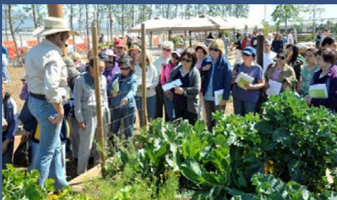
Farm + Food Lab