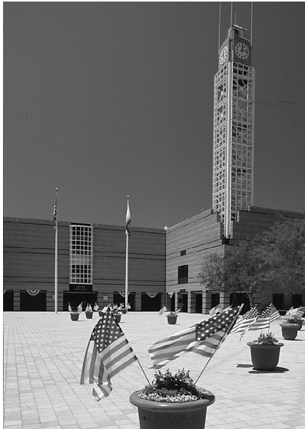
City Hall Piazza

The City of Irvine is located approximately two miles inland from the Pacific Ocean and 40 miles south of the City of Los Angeles. The City of San Diego is 80 miles south of Irvine.