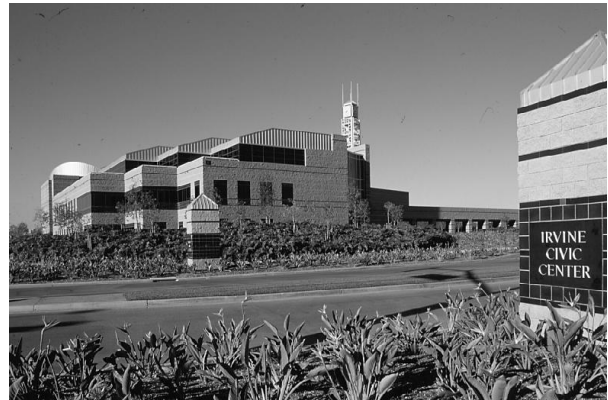
Irvine City Hall

Components of the urban design theme consist of a mix of land uses with a unique image and character including natural (hills and flatlands) and manmade (architectural styles, landscape and open space spines) features. Implementation of the General Plan's policies and standards creates a cohesive yet diversified image and identity for the community.