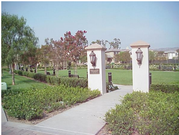
Neighborhood Park - Northpark

City recreational facilities and services include neighborhood parks, community parks and programs, an aquatic center, athletic complexes, a nature center and a fine arts center. The City has ten developed community park sites totaling 179 acres and one special facility of 15 acres. Expansions are planned at two of the park sites and another 45 acre site is in design development. There are 24 public