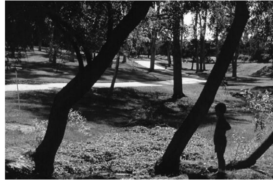
Turtle Rock Community Park

a community theater. Additional facilities and services located in parks include child care centers and senior centers. Mason Regional Park (operated by the County of Orange) currently provides recreational and open space facilities for the general public.